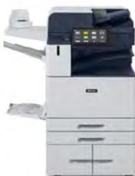
Xerox® AltaLink® C8130/C8135/ C8145/C8155/ C8170 Color Multifunction Printer