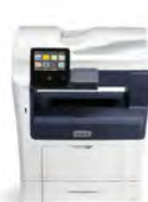
Xerox® VersaLink B405 Multifunction Printer