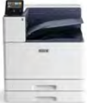
Xerox® VersaLink C8000 Color Printer