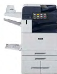
Xerox® AltaLink B8145/B8155/ B8170 Multifunction Printer

To learn more about Xerox® ConnectKey Technology, go to www.ConnectKey.com .