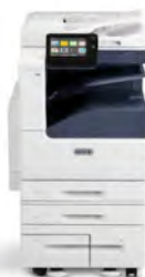
Xerox® VersaLink C7020/C7025/ C7030 Color Multifunction Printer