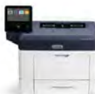
Xerox® VersaLink B400 Printer