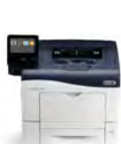
Xerox® VersaLink® C400 Color Printer