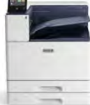
Xerox® VersaLink C9000 Color Printer