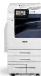
Xerox® VersaLink B7025/B7030/ B7035 Multifunction Printer